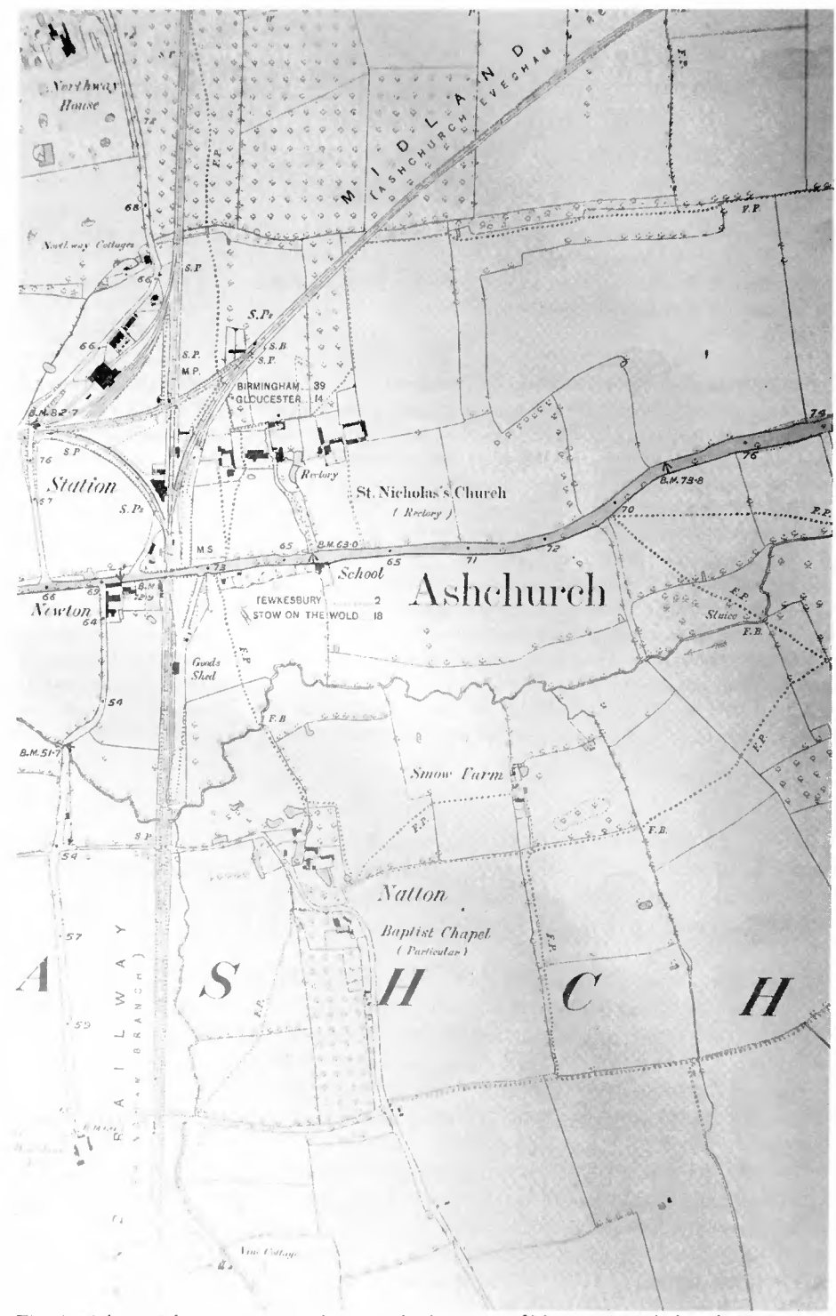
Fig. 1 A late 19th-century map showing the location of Natton, in Ashchurch (O.S. Map 6'', Glos. XII. SE. 1884 edn.).